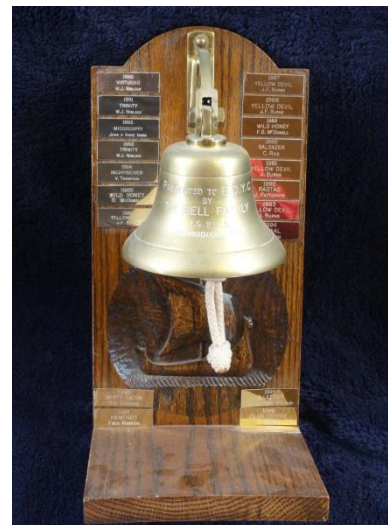
14 Captains Shield